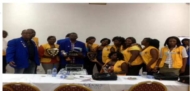
Oh yes, we are the best

So not only did the Lions enjoy the swim in the lake at the Sun and Sand Resort., they basked in glory knowing that, they came, they saw and they conquered the district! Considering that the club sprang back into life in November 2011, and getting all these awards in 2 years speaks volumes of the impact and service in our community. All this is testimony of the hard work that the club is putting in to make the community a better one and beyond and above that representing the Lions family in Zimbabwe.